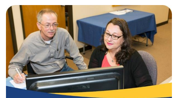
Learn about dementia from anywhere by participating in our live webinars