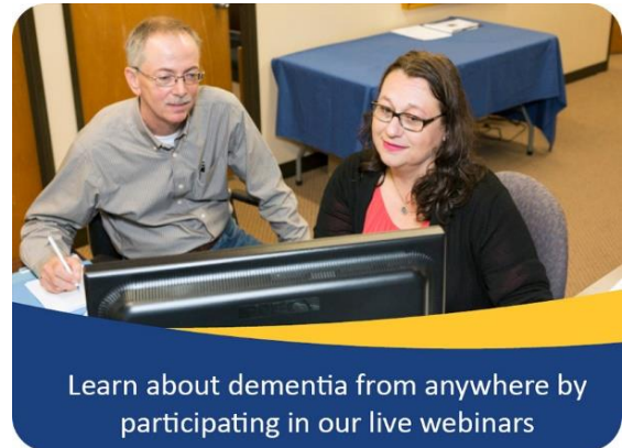
Learn about dementia from anywhere by participating in our live webinars

All sessions are hosted in Microsoft Teams. To register for our upcoming webinars, visit our website at alzbc.org/webinars . You can watch the education content on-demand at alzbc.org/ondemand .