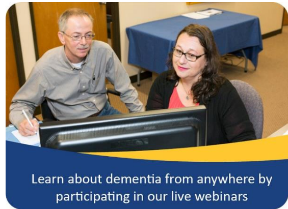
Learn about dementia from anywhere by participating in our live webinars

All sessions are hosted in Microsoft Teams. To register for our upcoming webinars, visit our website at alzbc.org/webinars . You can watch the education content on-demand at alzbc.org/ondemand .