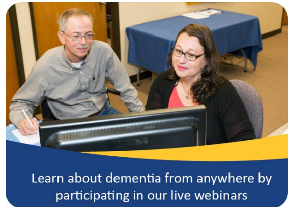
Learn about dementia from anywhere by participating in our live webinars

All sessions are hosted in Microsoft Teams. To register for our upcoming webinars, visit our website at alzbc.org/webinars . You can watch the education content on-demand at alzbc.org/ondemand .