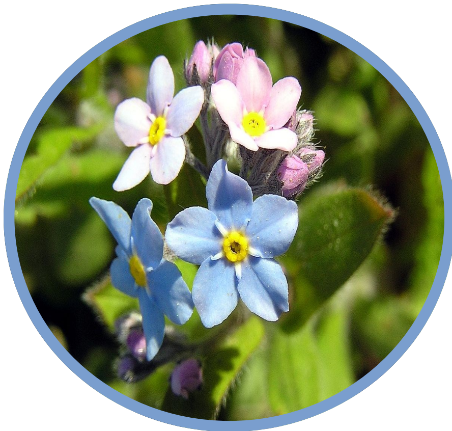
The Forget-Me-Not Flower Myosotis Scorpioide