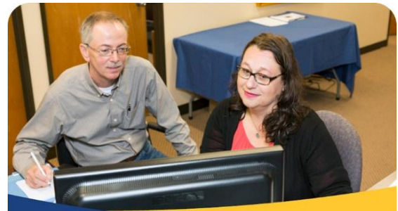
Learn about dementia from anywhere by participating in our live webinars

All sessions are hosted in Microsoft Teams. To register for our upcoming webinars, visit our website at alzbc.org/webinars . You can watch the education content on-demand at alzbc.org/ondemand .