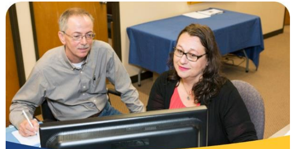
Learn about dementia from anywhere by participating in our live webinars

All sessions are hosted in Microsoft Teams. To register for our upcoming webinars, visit our website at alzbc.org/webinars . You can watch the education content on-demand at alzbc.org/ondemand .