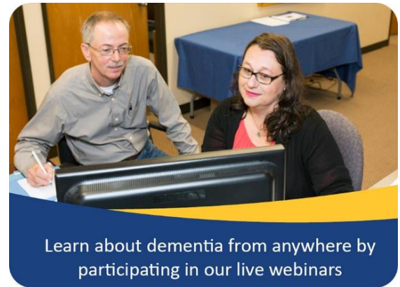
Learn about dementia from anywhere by participating in our live webinars

All sessions are hosted in Microsoft Teams. To register for our upcoming webinars, visit our website at alzbc.org/webinars . You can watch the education content on-demand at alzbc.org/ondemand .