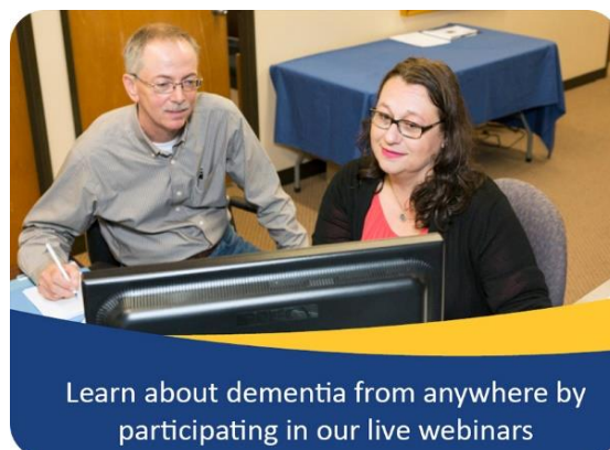
Learn about dementia from anywhere by participating in our live webinars

All sessions are hosted in Microsoft Teams. To register for our upcoming webinars, visit our website at alzbc.org/webinars . You can watch the education content on-demand at alzbc.org/ondemand .