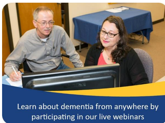
Learn about dementia from anywhere by participating in our live webinars

All sessions are hosted in Microsoft Teams. To register for our upcoming webinars, visit our website at alzbc.org/webinars . You can watch the education content on-demand at alzbc.org/ondemand .