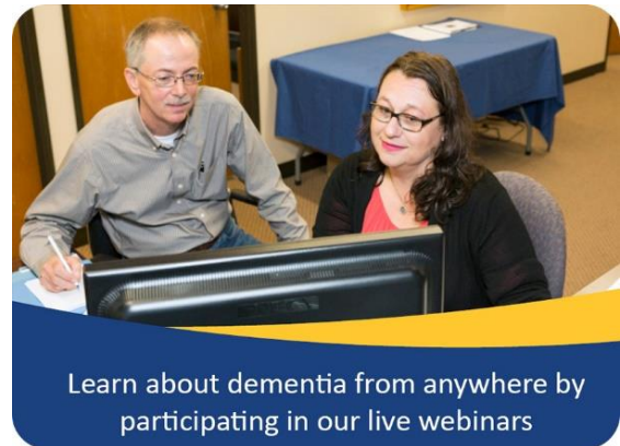
Learn about dementia from anywhere by participating in our live webinars

To register for our upcoming webinars or watch recorded videos, visit our website at alzbc.org/webinars .