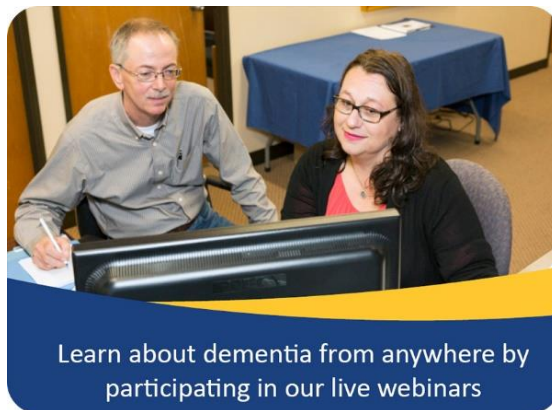
Learn about dementia from anywhere by participating in our live webinars

All sessions are hosted in Microsoft Teams. To register for our upcoming webinars, visit our website at alzbc.org/webinars . You can watch the education content on-demand at alzbc.org/ondemand .