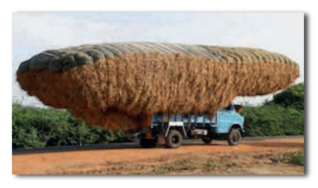
Farmer Rick was dead set on making it all in one trip.

Now it's your turn to come up with a good caption.