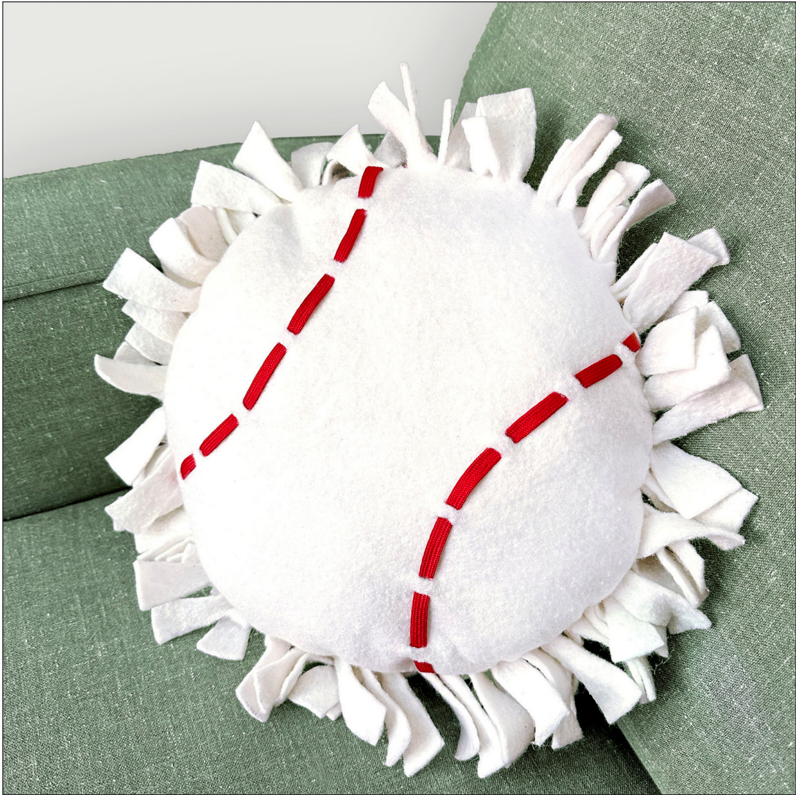
No-Sew Baseball Pillow