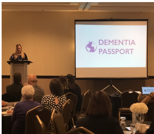
The unveiling of the Dementia Passport Logo, on January 17th, 2019.