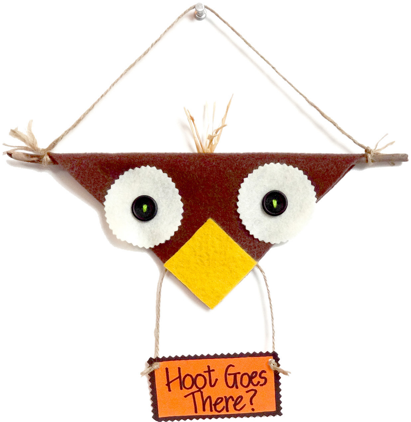
Hoot's There? Door Décor