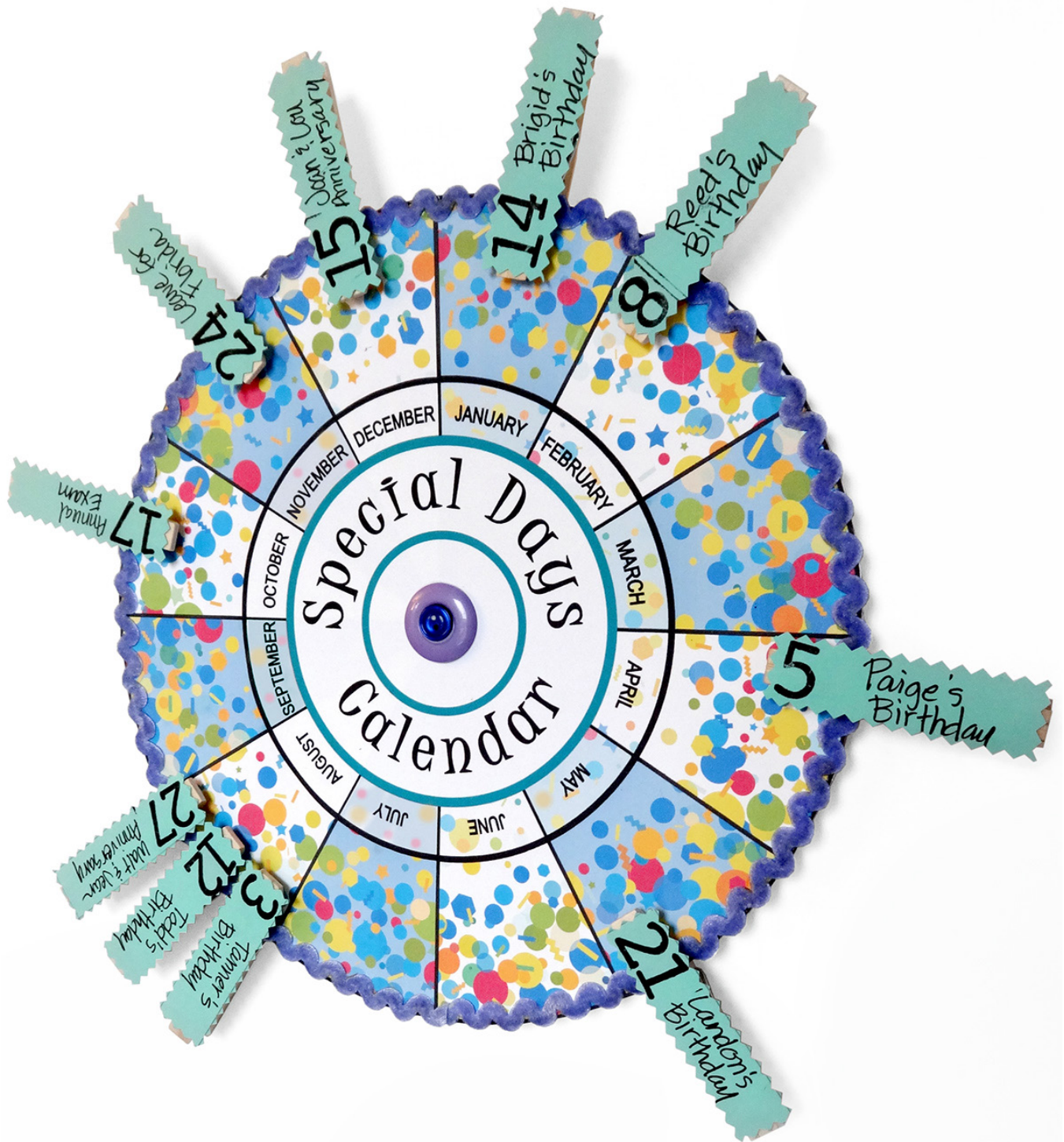
Perpetual Special Days Calendar