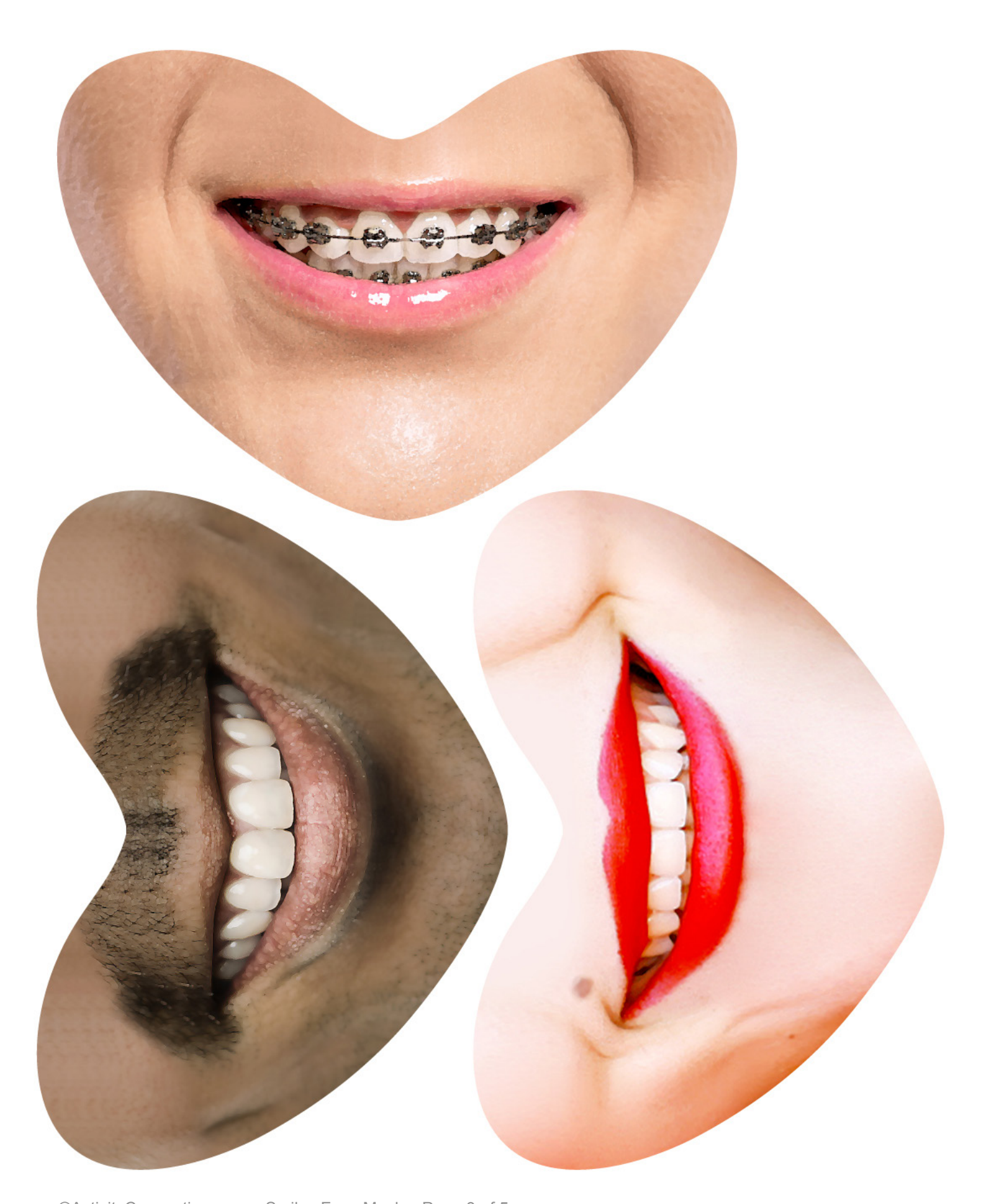
\hbox{@ActivityConnection.com-Smiley Face Mask-Page 3 of 5}\\