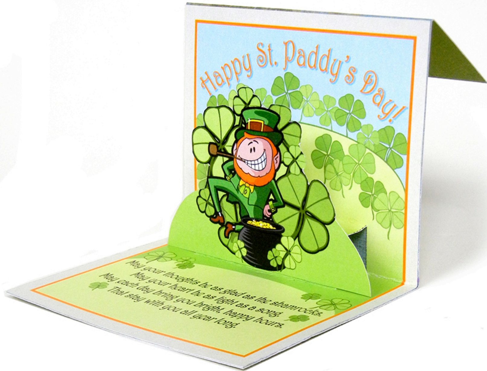
Pop-Up Paddy's Day Card