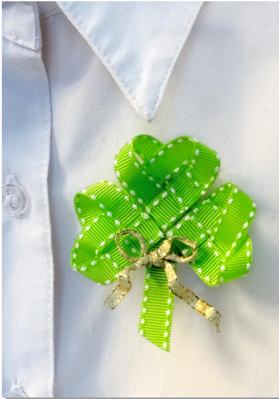
Ribbon Shamrock Pin