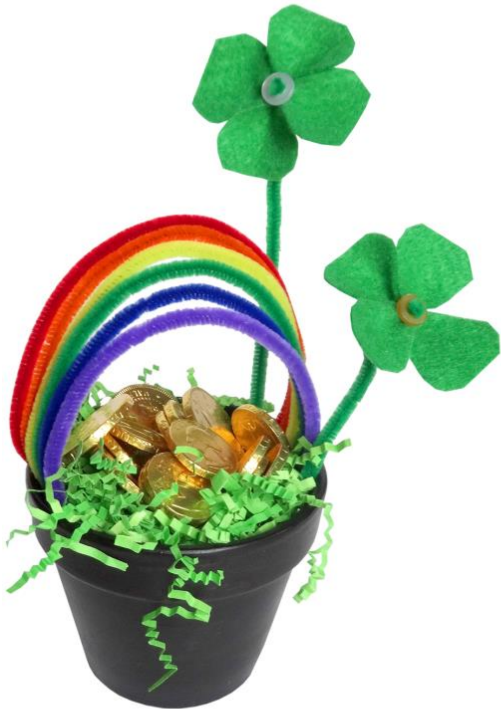
Pot o' Gold Centerpiece