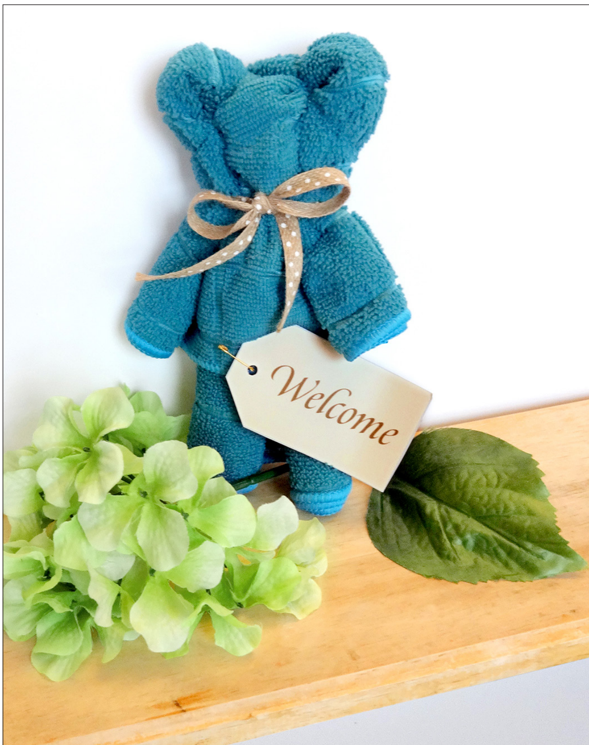
Welcome Bear Ledge Décor