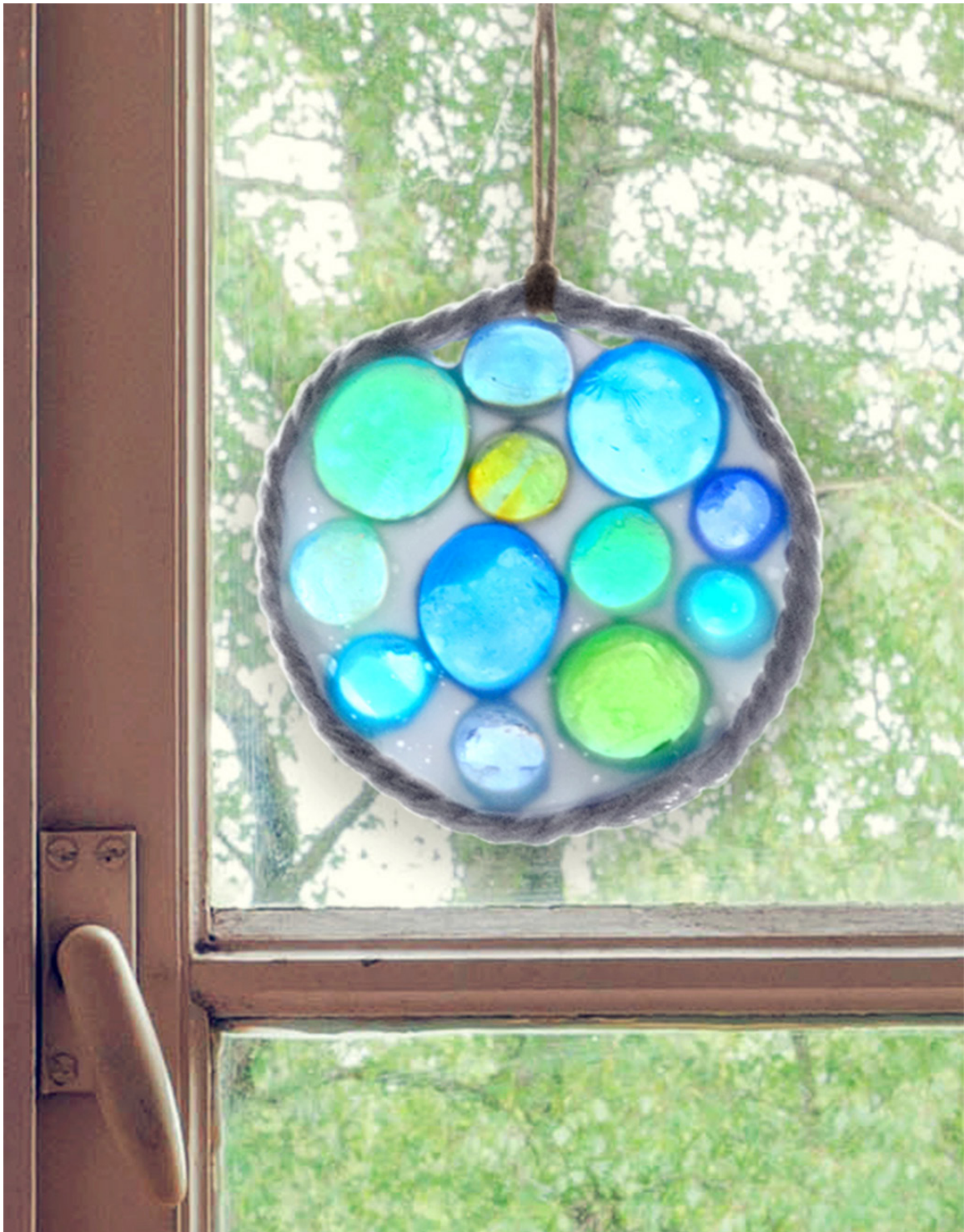
Suncatcher Window Décor