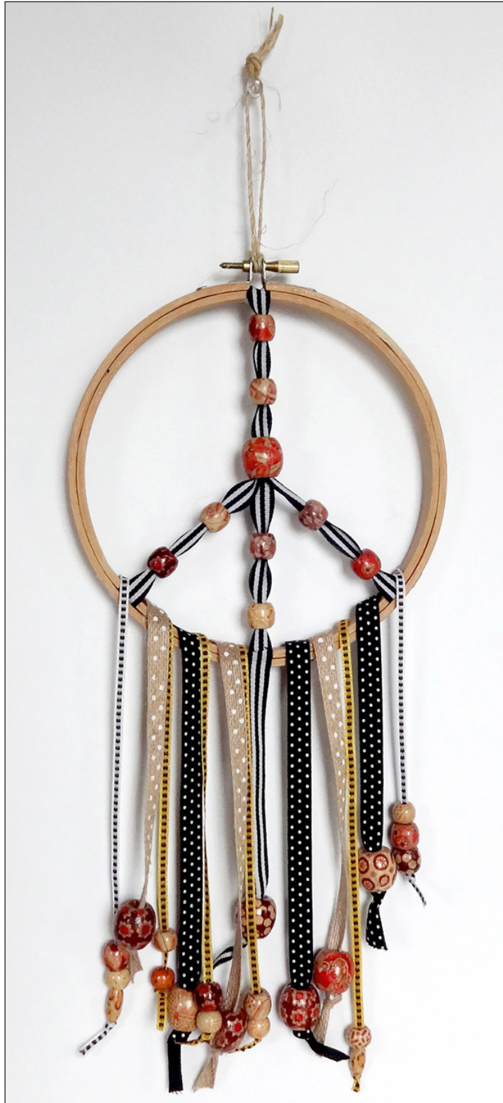
Peaceful Door Décor