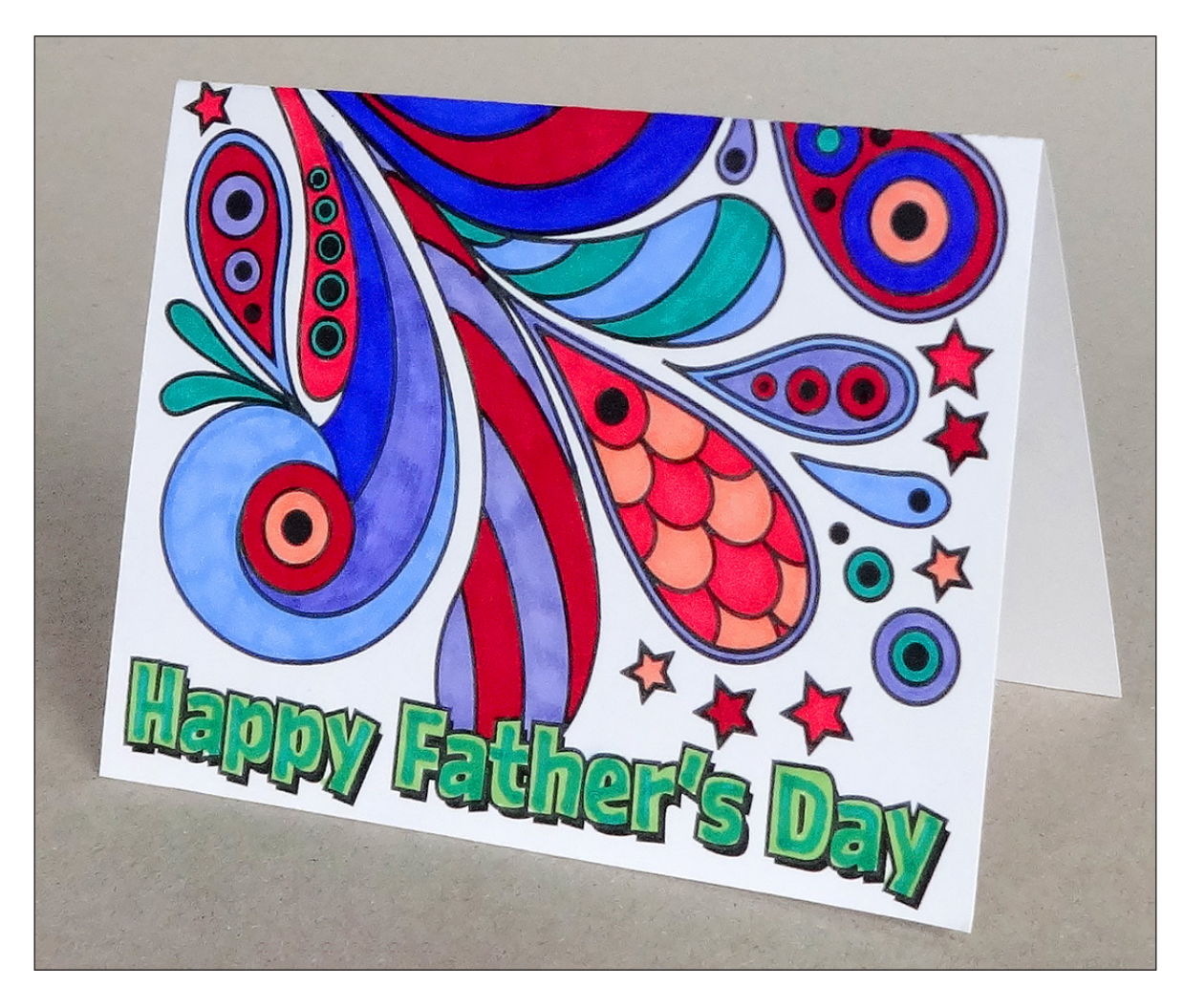
Dad's Day Doodle Card