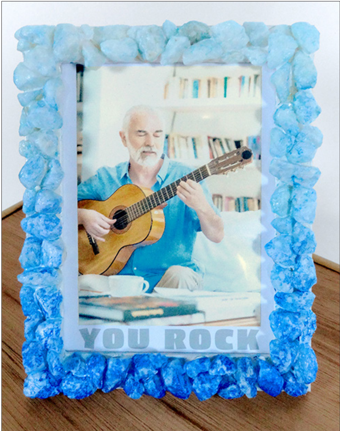
"You Rock" Frame