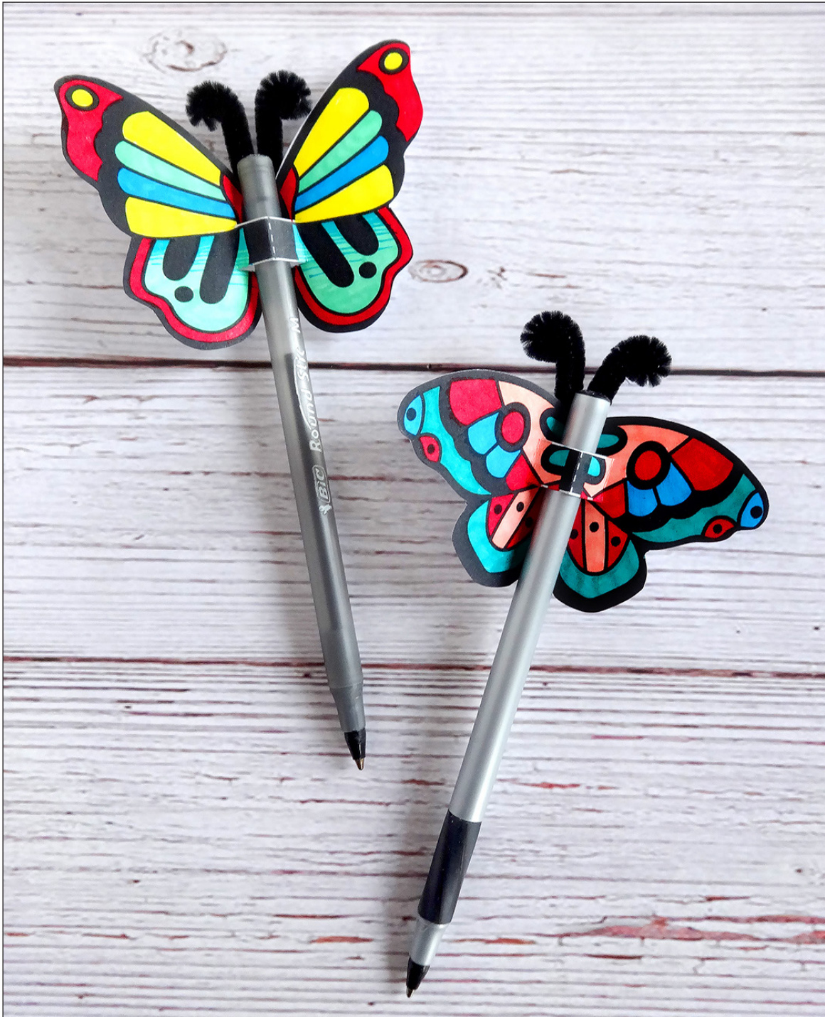
Butterfly Pen Toppers