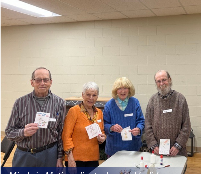
Minds in Motion clients donated holiday cards to the Men's Shelter