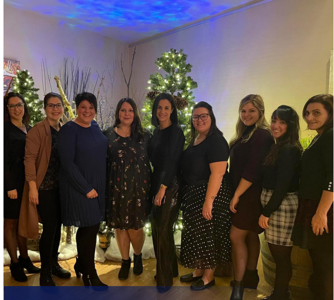
Wine, Women & Purses 2022

Our Health Bistro Adult Day Programs hosted 6775 attendance days