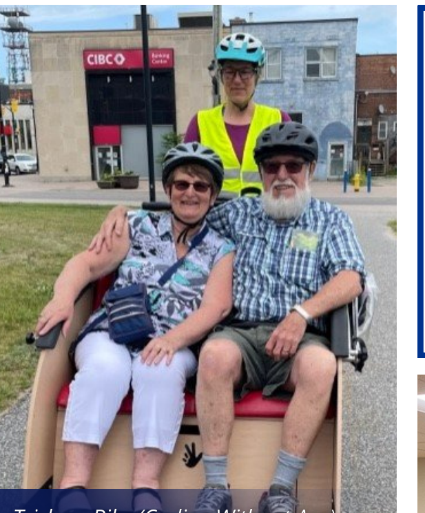
Trishaw Bike (Cycling Without Age)