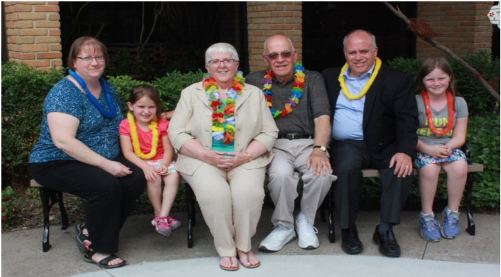
Client & Volunteer Appreciation BBQ